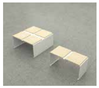
Furniture Galvanized and painted. Built to withstand the abuse of a coin laundry environment