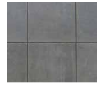
Floor tiles High performance flooring in porcelain tile with glazed surface