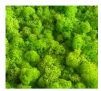
Vertical green Natural lichen that can be used only indoors. ►no maintenance required